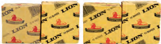
COUNTERFEIT GENUINE COUNTERFEIT GENUINE