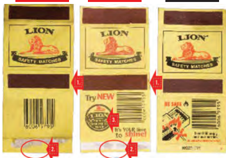
COUNTERFEIT COUNTERFEIT GENUINE